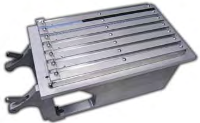
PPM 8mm Cut Tape Feeder Fits C and Q series.

Introducing the Cut Tape Feeder and the 8mm x 2mm Feeder for smaller components.