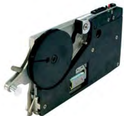
PPM 8mm x 2mm Feeder 0402 - 0201