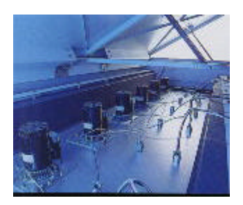
Clean wiring and sleek design characterize the interior as well as the exterior of the 1500EXL

A more streamlined appearance, with integral CPU and keyboard, plus robust, heavy-duty construction for years of reliable service.