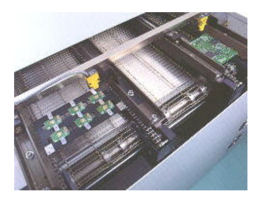
To maximize flexibility, 1500EXL users may specify width-adjustable single edge hold conveyor or dual-rail edge hold conveyor with each side independently adjustable for width and speed.

With a high-capacity, 26-inch-wide (66 cm) tunnel, the 1500EXL offers unmatched flexibility in board handling. The oven may be fitted with an adjustable single-rail edge hold conveyor, to carry even the largest boards or multi-board panels, up to 23.5 inches wide (60 cm), through the oven.