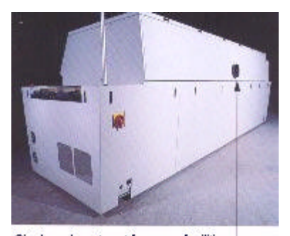
Single exhaust port for easy facilities interface and consistent profiling